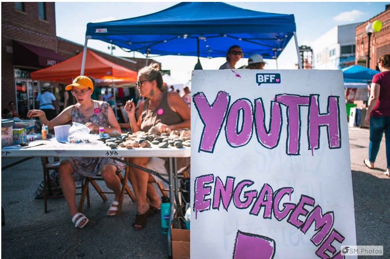
June's first Friday youth Engagement Activity, Rock Creations for Father's Day.